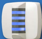
Code Blue (flashing)