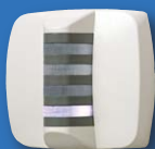
Normal bed call